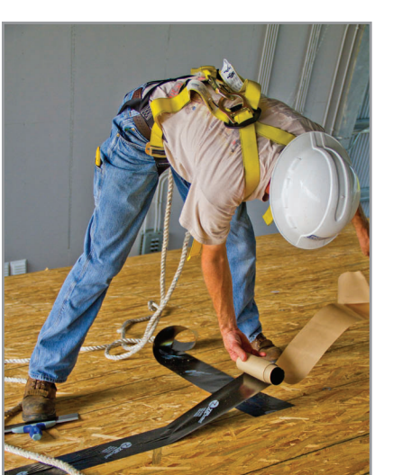
Sealing the roof deck.

Too often when a hurricane strikes, roof cover (typically shingles, tile, or metal) blows off, exposing the roofing layers underneath to the full fury of wind and rain. Post-hurricane damage investigations and tests at the IBHS Research Center have demonstrated that many commonly used roofing felts, which are placed between roof cover and decking, easily blow off in hurricane-force winds. While the roofing industry historically has referred to roofing felt as a suitable backup to reduce chances of roof leaks, IBHS does not consider typical felt underlayments the protective equivalent of a sealed roof deck. As a result, IBHS defines a properly sealed roof deck as one where seams or gaps between pieces of decking are sealed so that water cannot flow into the attic. This sealant bonding or attachment to the deck materials must be strong enough to stay in place if the roof cover blows off.